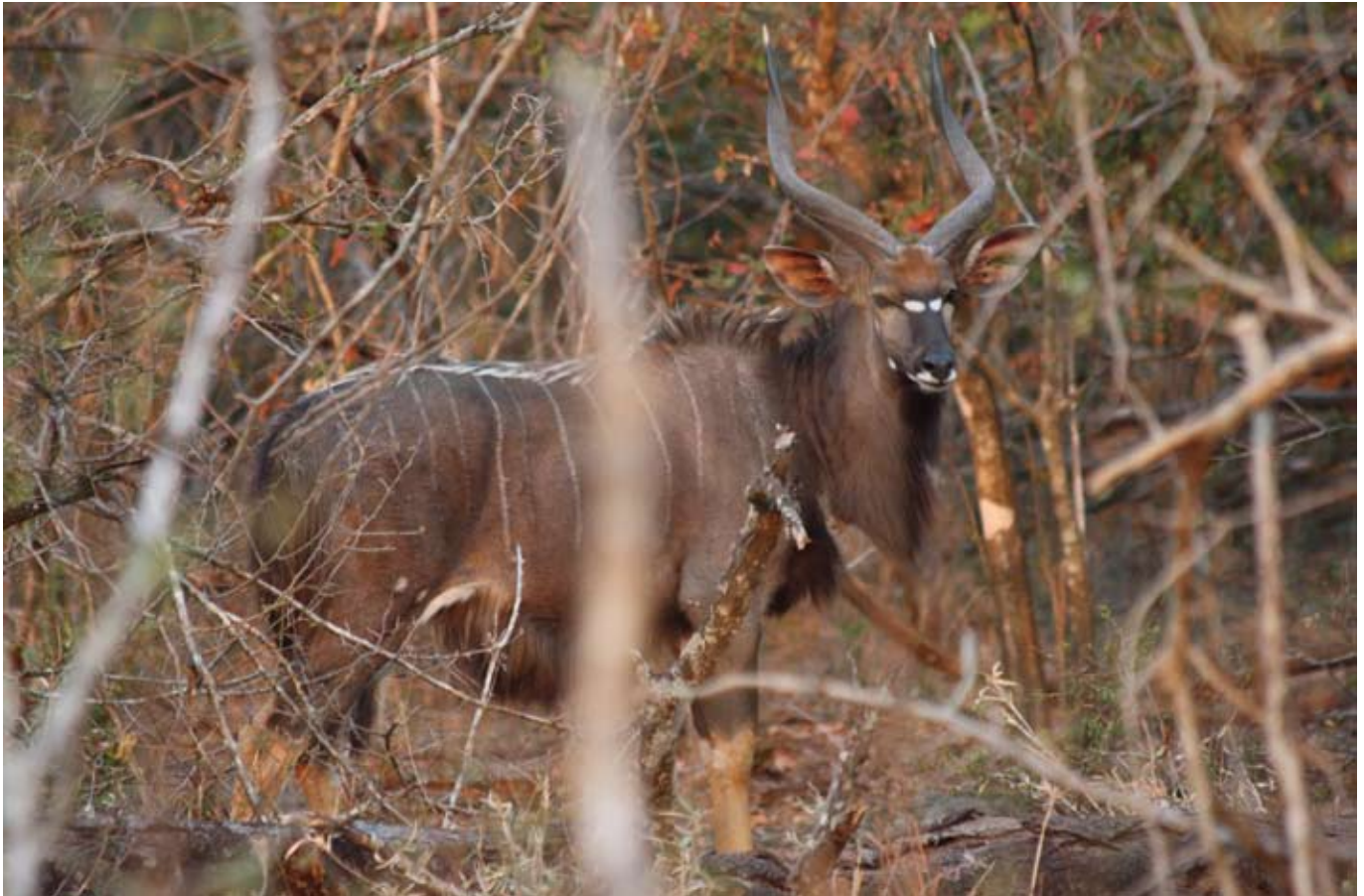
Male nyala in the game re-introduction sanctuary in Majete Wildlife Reserve.

carry the white recessive gene, with their fathers being pure white lions and their mothers a normal brown lion. This will increase the genetic pool of the white lion population worldwide. They will soon be joined by two pure white females.